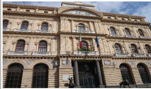
Headquarters of the Chamber of Commerce of Naples

Headquarters of the Chamber of Commerce of Naples Via S. Aspreno 2, Napoli