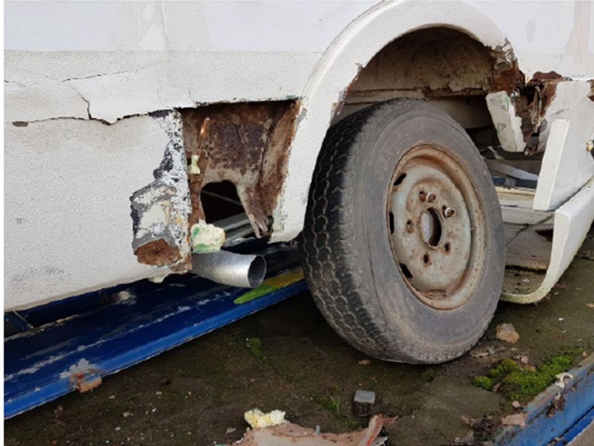
A Volkswagen bus LT3590 from 1988 for Lagos, Nigeria with many damages: left auxiliary beam 100% rust damage, shaft seriously deformed, heavy gasoline smell