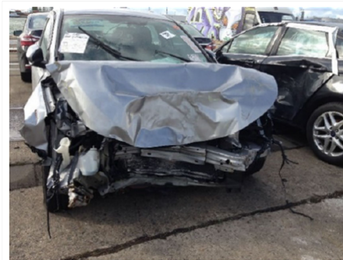
Wrecks from the US waiting for loading in the port of Antwerp with Lagos, Nigeria as its destination © ILT October 2019

The image contain the links to the report