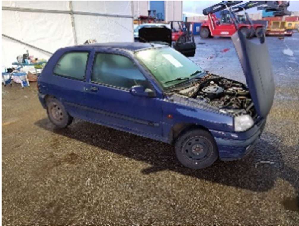
A Renault, 1997 for Benghazi, with tires completely worn