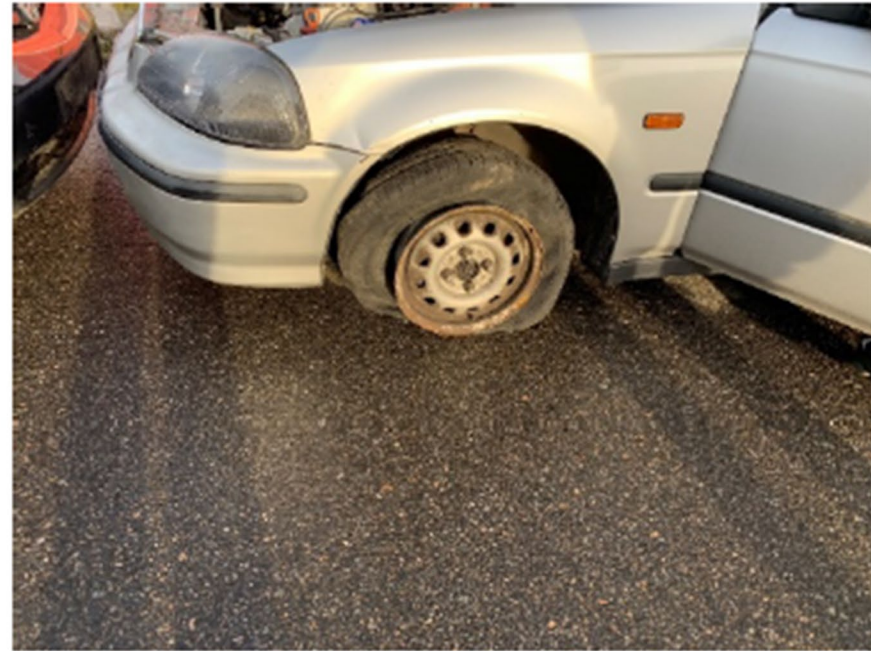
A heavily damaged car after an accident, a Nissan Micra from 2003 for Benghazi, Libya (left picture). A Honda Civic from 1996 for Lybia. The axles, wheels and tyres had several deficiencies (right picture).