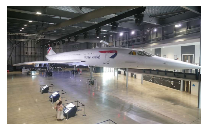
Concorde at Aerospace Bristol