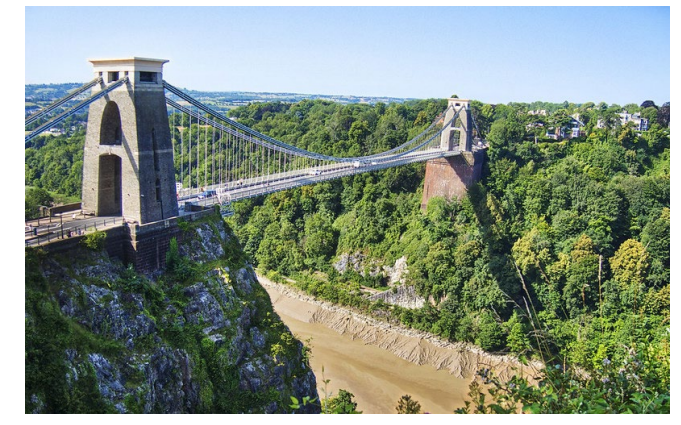
<u>Clifton Suspension Bridge</u> and nearby <u>Clifton Observatory &</u> <u>Giant's Cave</u>

• If you have time to stay in Bristol, popular places to visit include: