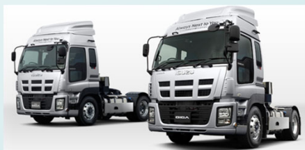
ISUZU:Tokyo Motor Show 2011 Giga