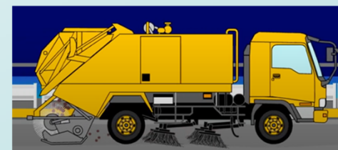
Road Sweeper | Isuzu Motors Limited