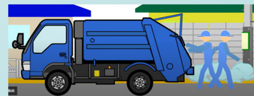
Garbage Truck | Isuzu Motors Limited