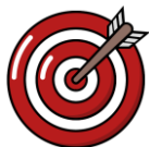
Table of content

All SGs agreed on a Table of content ( 2024 SG7 TableofContent v3 )