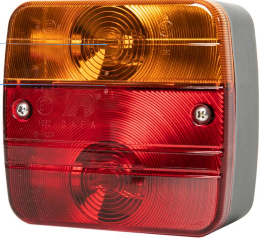
Standard rear lamp on the market

Justification: Existing solution without problem for the D.I. visibility when the STOP is "ON" should not be cancelled (minimum 50% of the D.I. apparent surface at more than 25 mm from the STOP )