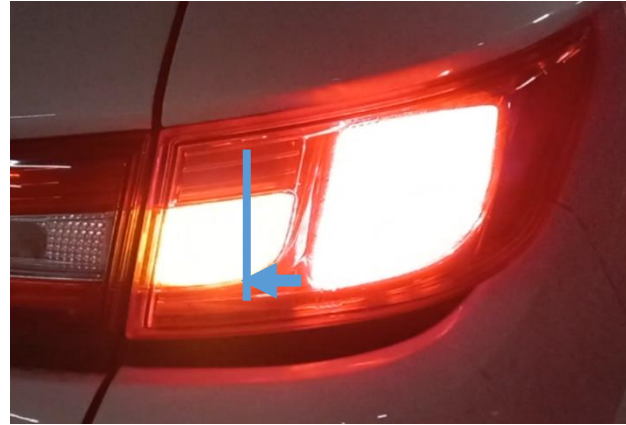
See SLR-69-08 videos