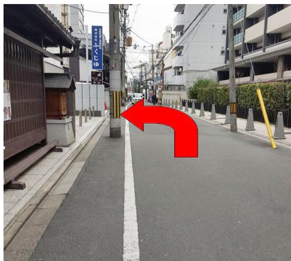
④ At the left hand, there is a signboard "TKP".