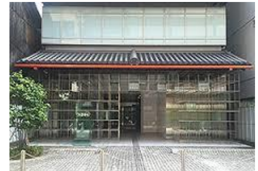
TKP Kyoto Schijo-Karasuma Conference Center