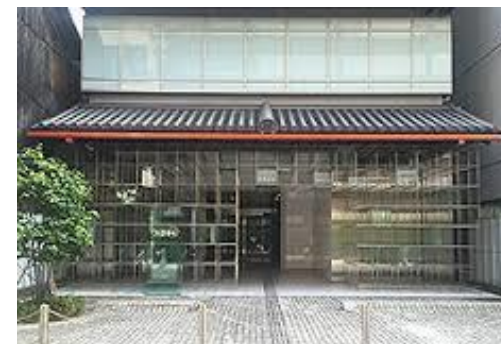
TKP Kyoto Schijo-Karasuma Conference Center