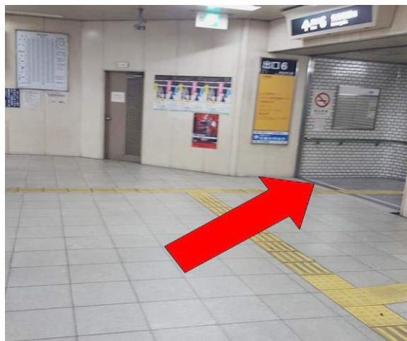
① Go out Exit No. 6 of Shijo Station