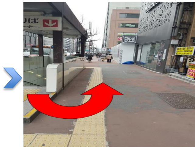
② Turn left on the ground and go straight ahead