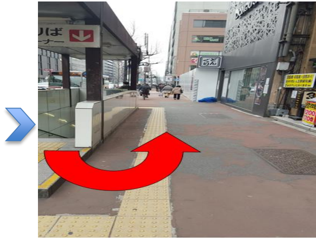
② Turn left on the ground and go straight ahead