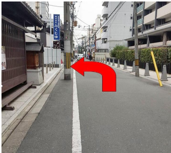
④ At the left hand, there is a signboard "TKP".