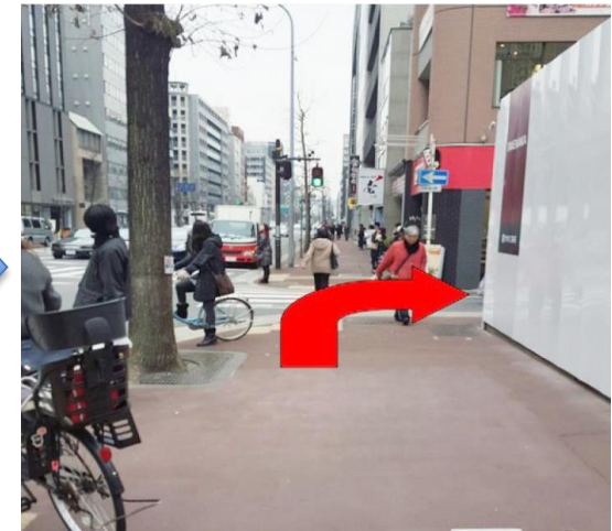
③ Turn Right at the first traffic light