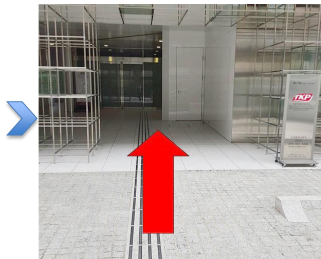
⑤ You can check the room number at the lobby.