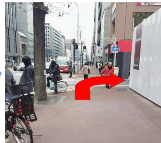
③ Turn Right at the first traffic light