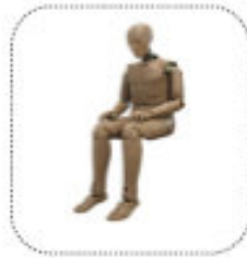
Harmonized Hybrid III 50 th Male User Manual 78051-9900-H [Rev. A]