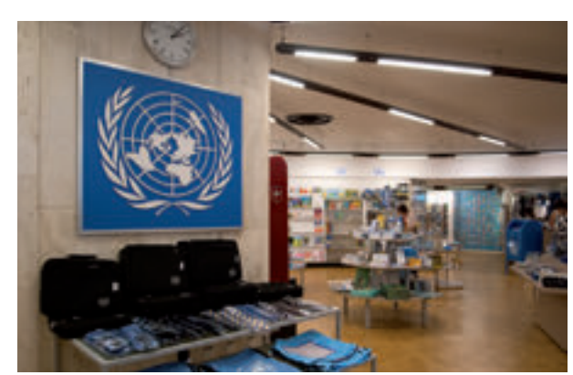
BOOKSHOP | SOUVENIRS Building E - 2nd Floor