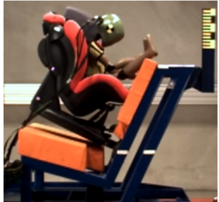
r129 Rear impact with Q3 and isofix installation