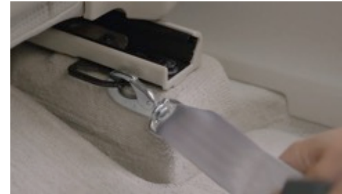
Example of LTA according ISO 13216