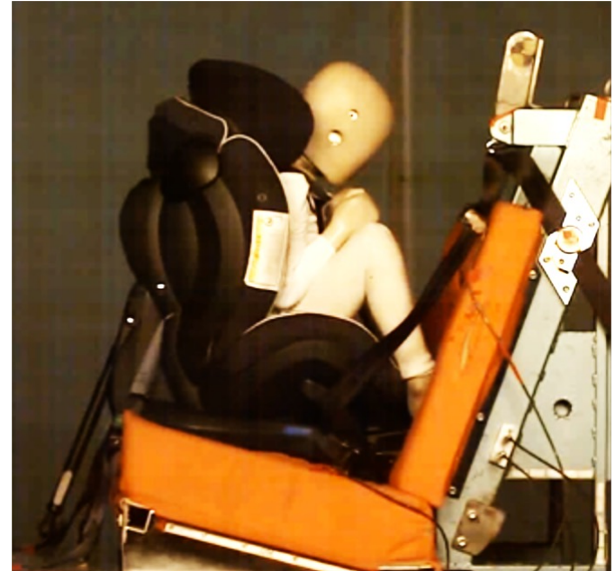
r44-04 Rear impact with P6 during impact: all injury criteria very well within the limits and rotation is stopped