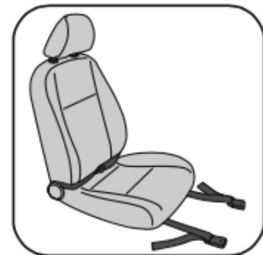
Examples of LTA in the practice of today when no standardized LTA is available