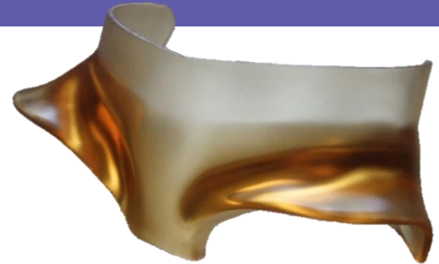
Q10 Hip liner