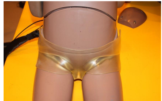
Q6 Hip liner on dummy