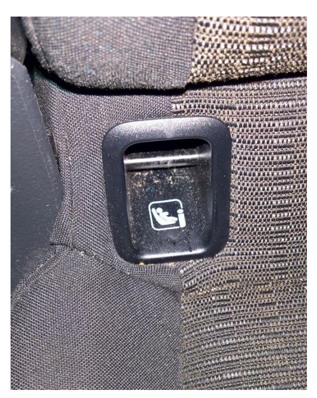
i-Size seating position