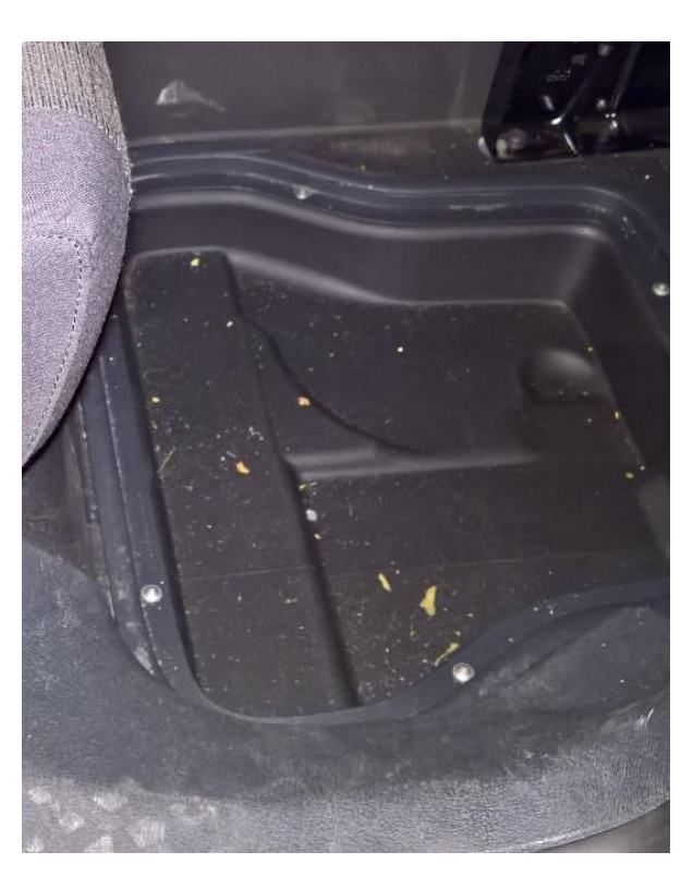
Can an i-Size ECRS be used here or not?