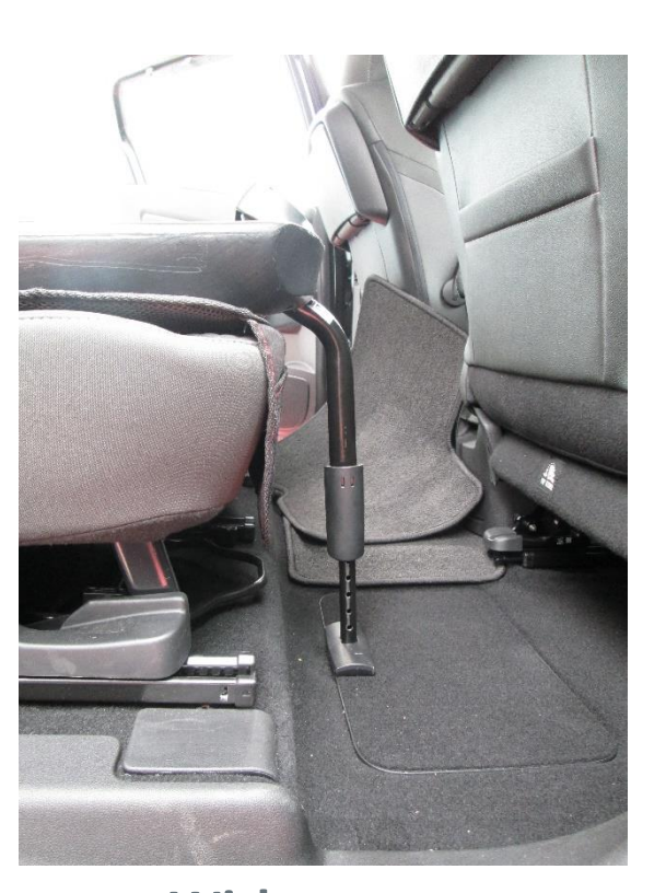
With storage compartment