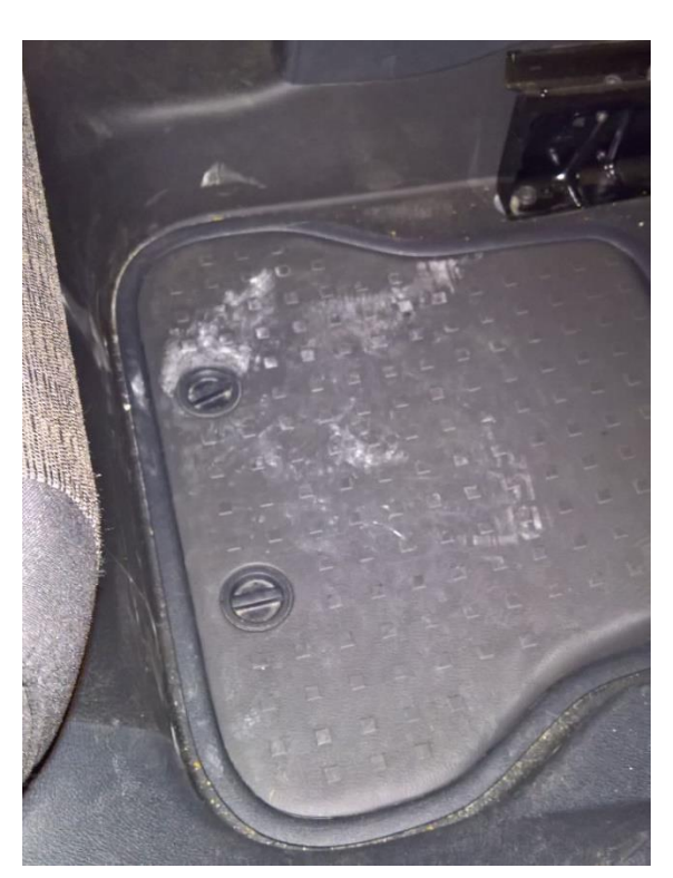
With storage compartment