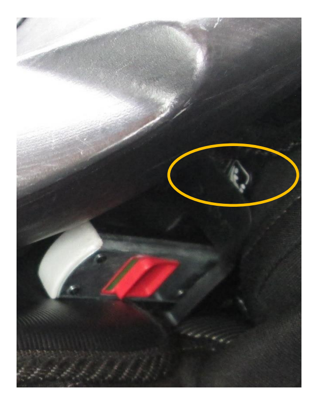
i-Size seating position