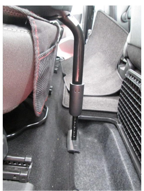
Can an i-Size ECRS be used here or not?