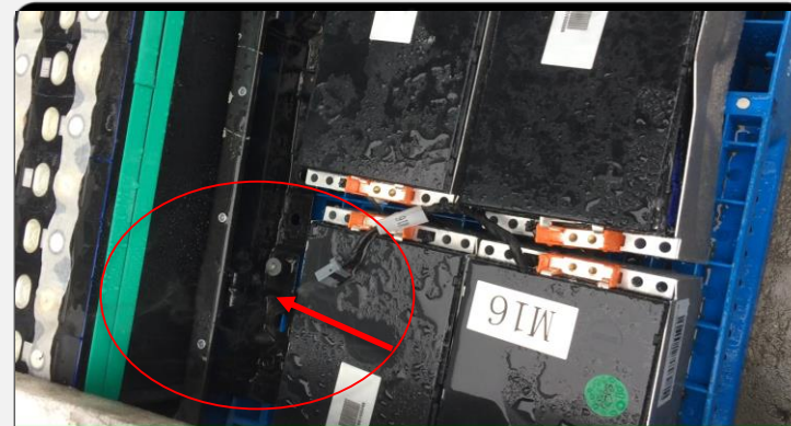
2.2KWh NCM Module