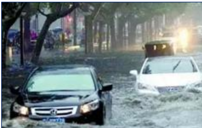
2016/07/04,Wuhan,Heavy rain wading