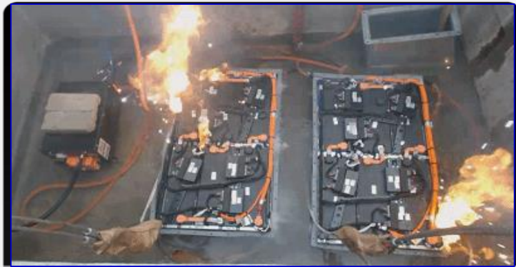
26KWh LFP Pack