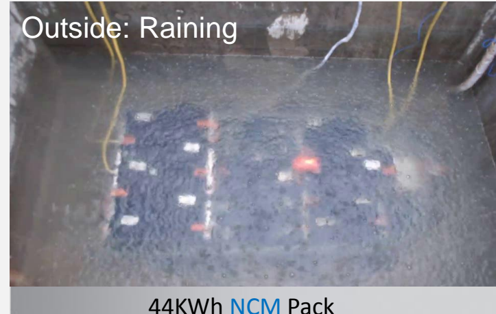
44KWh NCM Pack