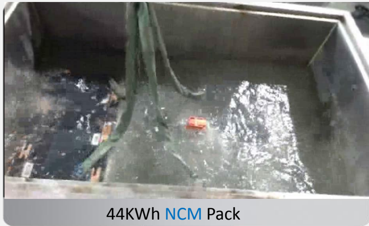
44KWh NCM Pack