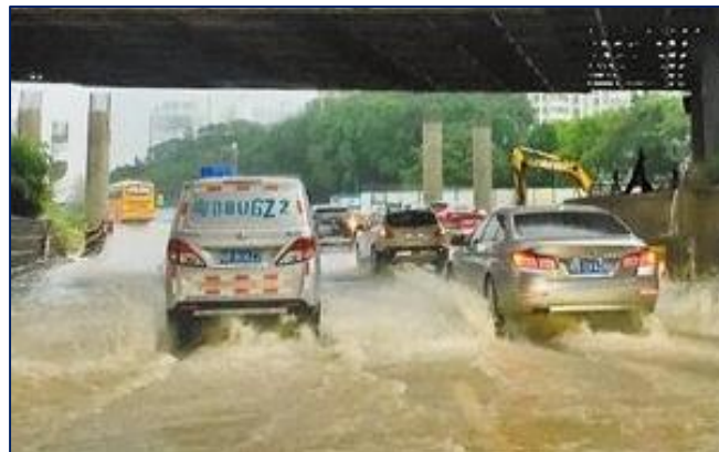
2017/07/18,Shenzhen, Heavy rain wading