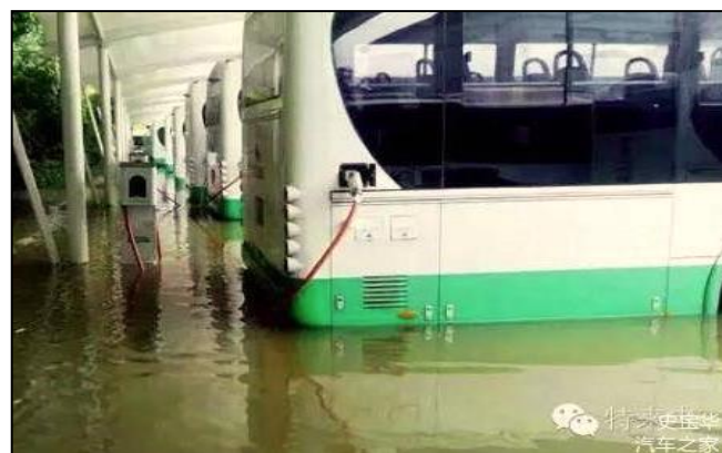
Soaking when charging