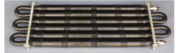
Type IV carbon fiber conformable H2 tank 70MPa