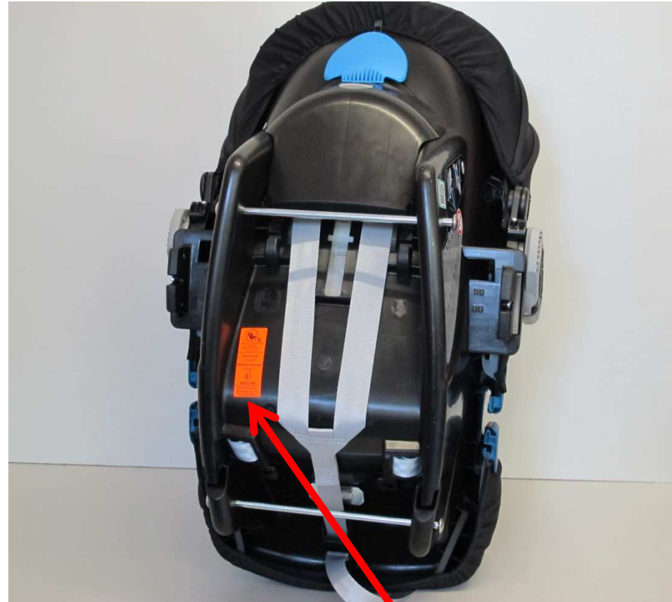
ECE 44 Label