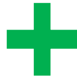
Para. 5.2.1.4. Requirement for M1

Test vehicle speed range: Between 10 km/h and 60 km/h